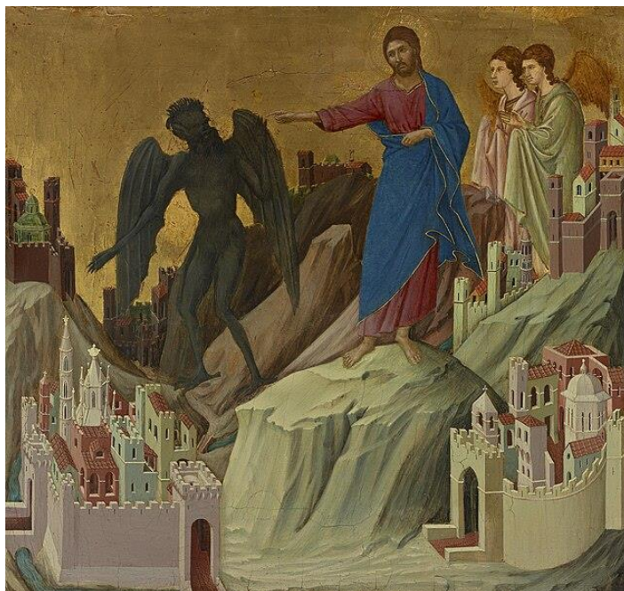
The Temptation of Christ on the Mountain by Buoninsegna, 1310